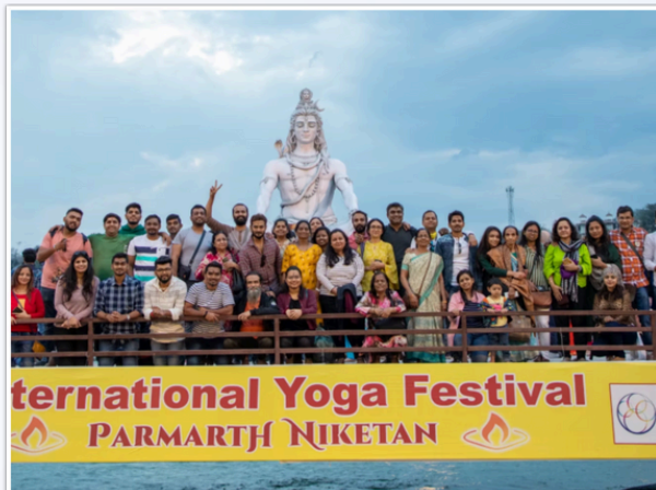
Himalaya Workshops & Retreats