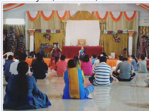
Satsang, Spiritual Discourses and Namasmaran...