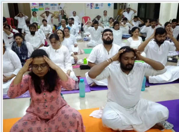
Dhyan (Meditation) Shibir